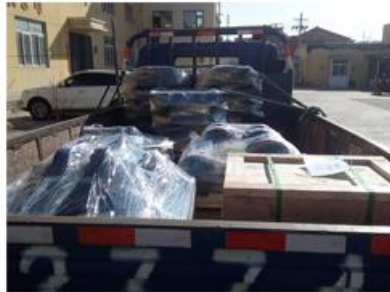
Parts are delivered to Port