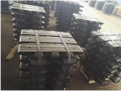
20pcs or 22pcs Track Shoes Each Pallet