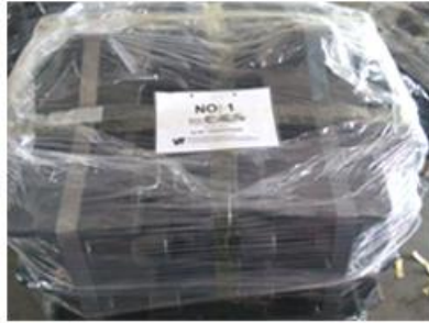
Each Pallet Covered With Thin Film and Sticker