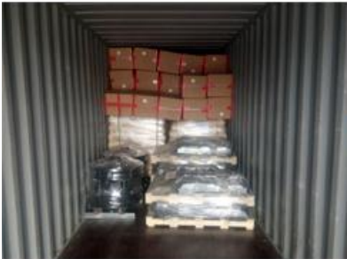
Parts in the Container